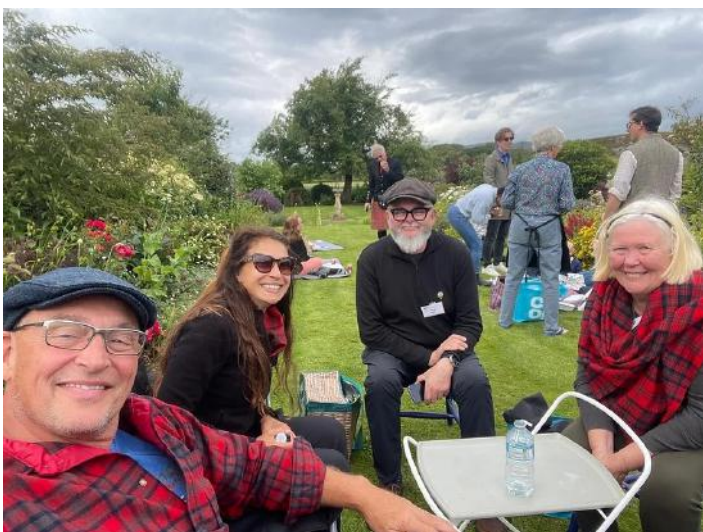
Mathesons from around the world picnicking at Duirinish