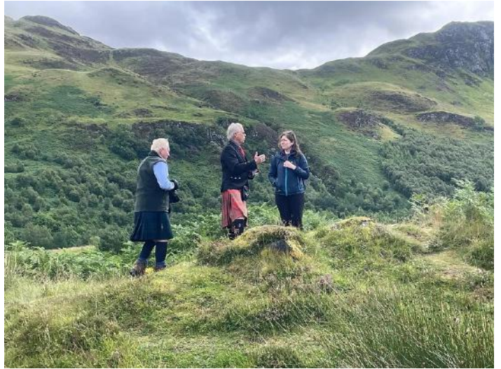
Suitably attired for a stop on our Highland jaunt