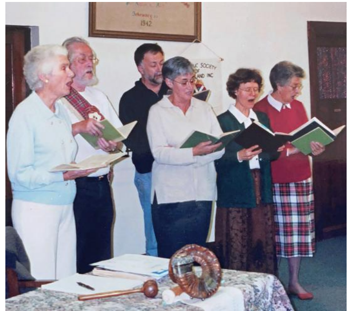
The choir at the society’s final meeting

The end came with a final meeting in 2006, and three years later the society was formally dissolved.