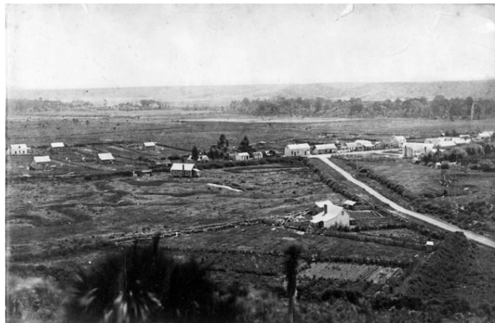
Turakina in 1870, six years after the first Highland games were held. The Ben Nevis hotel is among the buildings to the right.