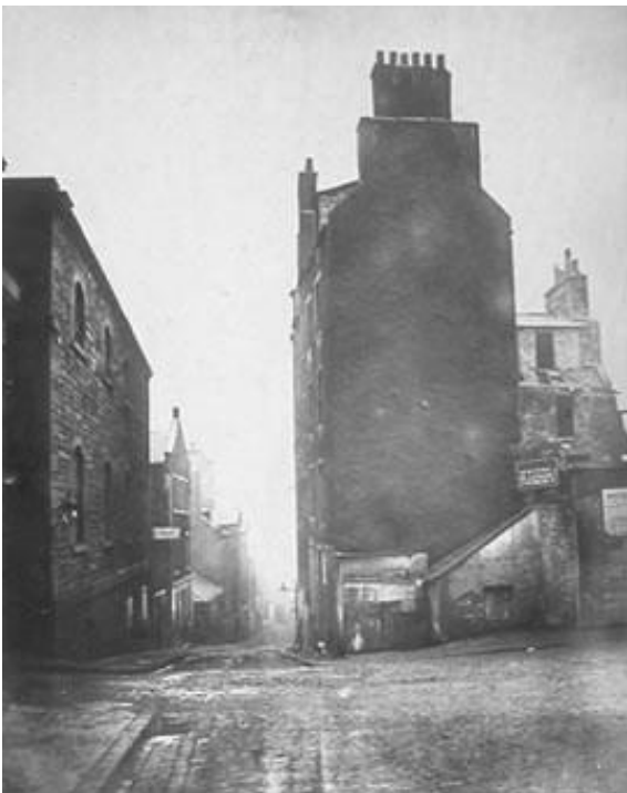
Horse Wynd, Edinburgh.