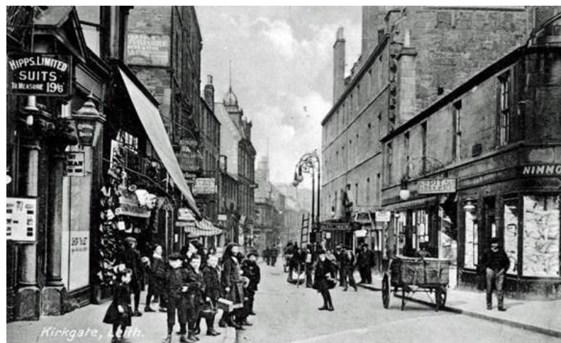
Kirkgate, Leith, in the 1880s

What was there is a collaborative site where people upload their old photos that are geotagged so anyone researching a particular area can discover relevant photos.