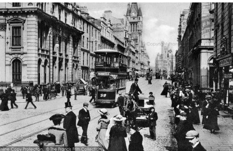
Union Street in Aberdeen in 1910

This photo of Kirkgate in Leith was taken at about the time they moved to the mainland. It shows a scene they would have seen in their everyday life, which helps bring to life research about this part of the family.