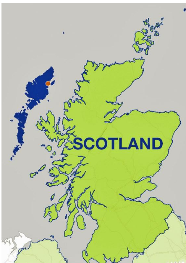
Scotland's Outer Hebrides (in blue), with their principal town Stornoway marked in red

Did your ancestors live in the Outer Hebrides? This website might have information about them