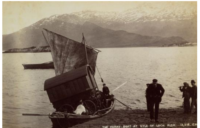
The Skye ferry at Kyle of Lochalsh with a precarious cargo. No bridge in those days!

It's easy to acquire photos off the internet by using right click/save image as or by using Microsoft's snipping tool , and I suspect that private (non-commercial) use of photos posted on the internet is largely tolerated. While this can often be done without payment it's courteous to at least acknowledge sources.