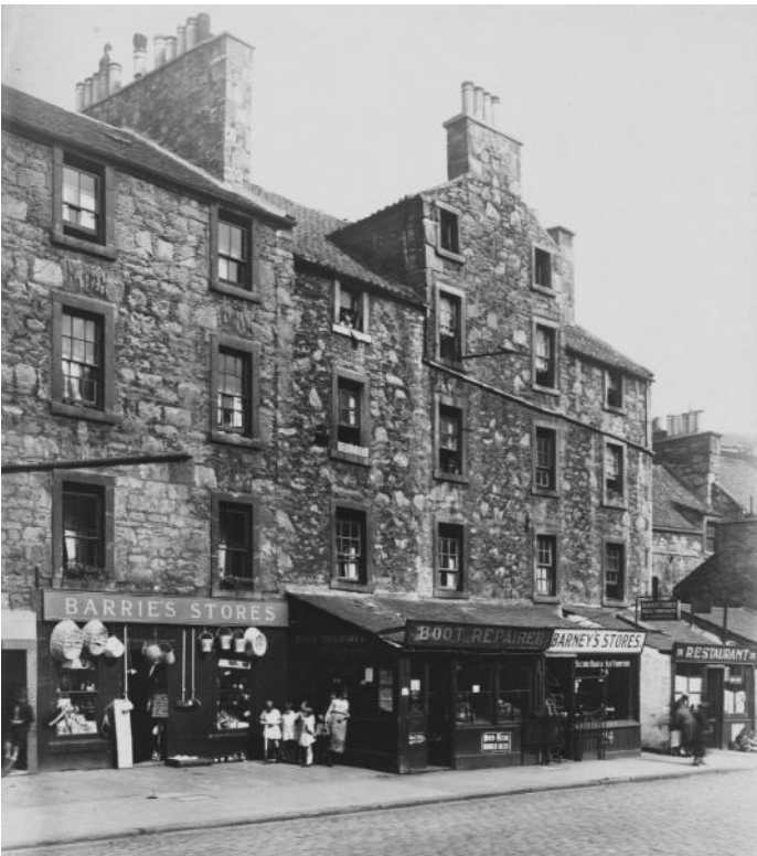
The south side of Edinburgh in 1929.

When researching streets or buildings it is worth looking at Canmore , the online catalogue to Scotland's archaeology, buildings and heritage.