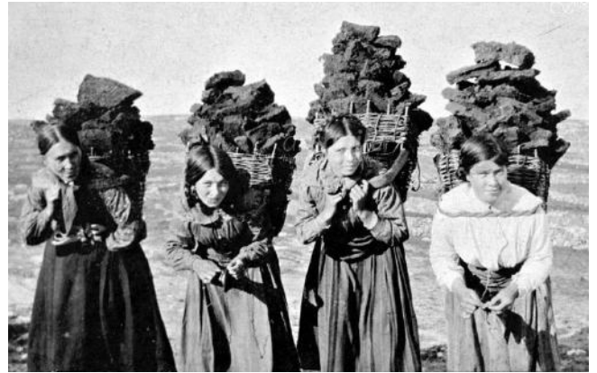
Transporting peat on the Isle of Lewis.

AmBaile provides free content about Highland history and culture, including thousands of photos. Don't forget the Hebridean Connections website profiled elsewhere in this issue.