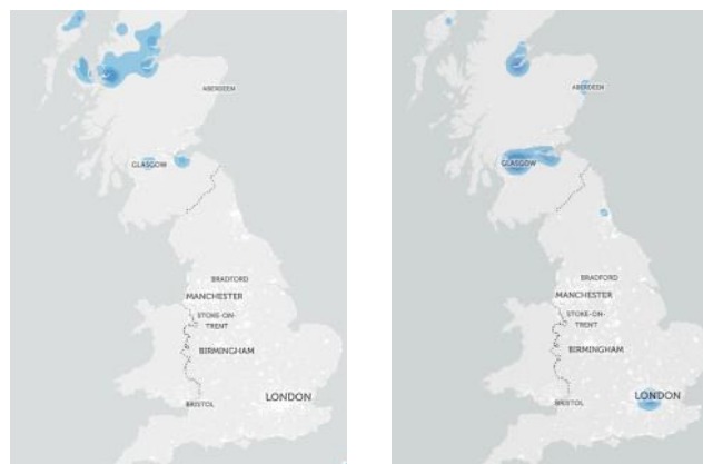
Distribution of Mathesons in 1851 (left) and 1998 (right)

The site also maps trends in forenames, and identifies the parishes and local government areas where surnames are concentrated. You can check it out here .