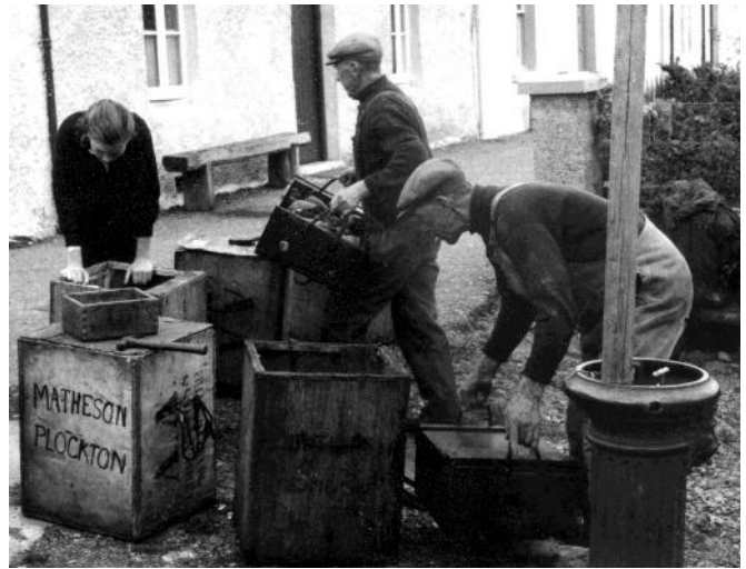
Packing the crabs for train transport to Aberdeen