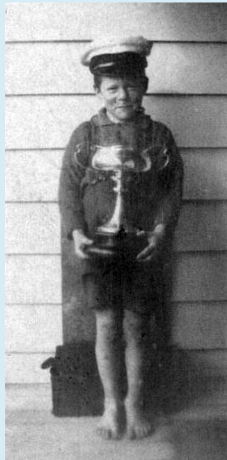
Early yachting success