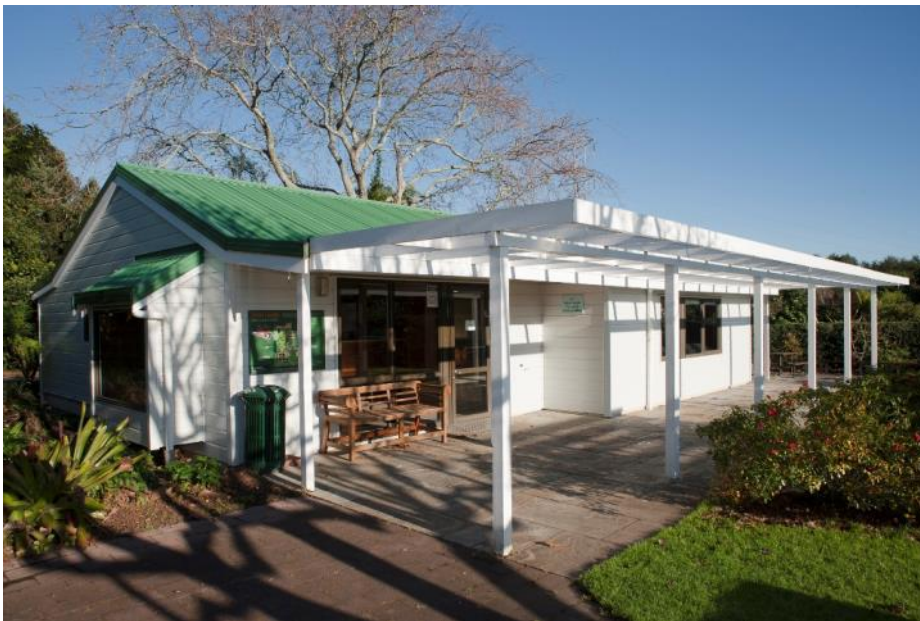
The Logan Campbell Room, Auckland Botanic Gardens